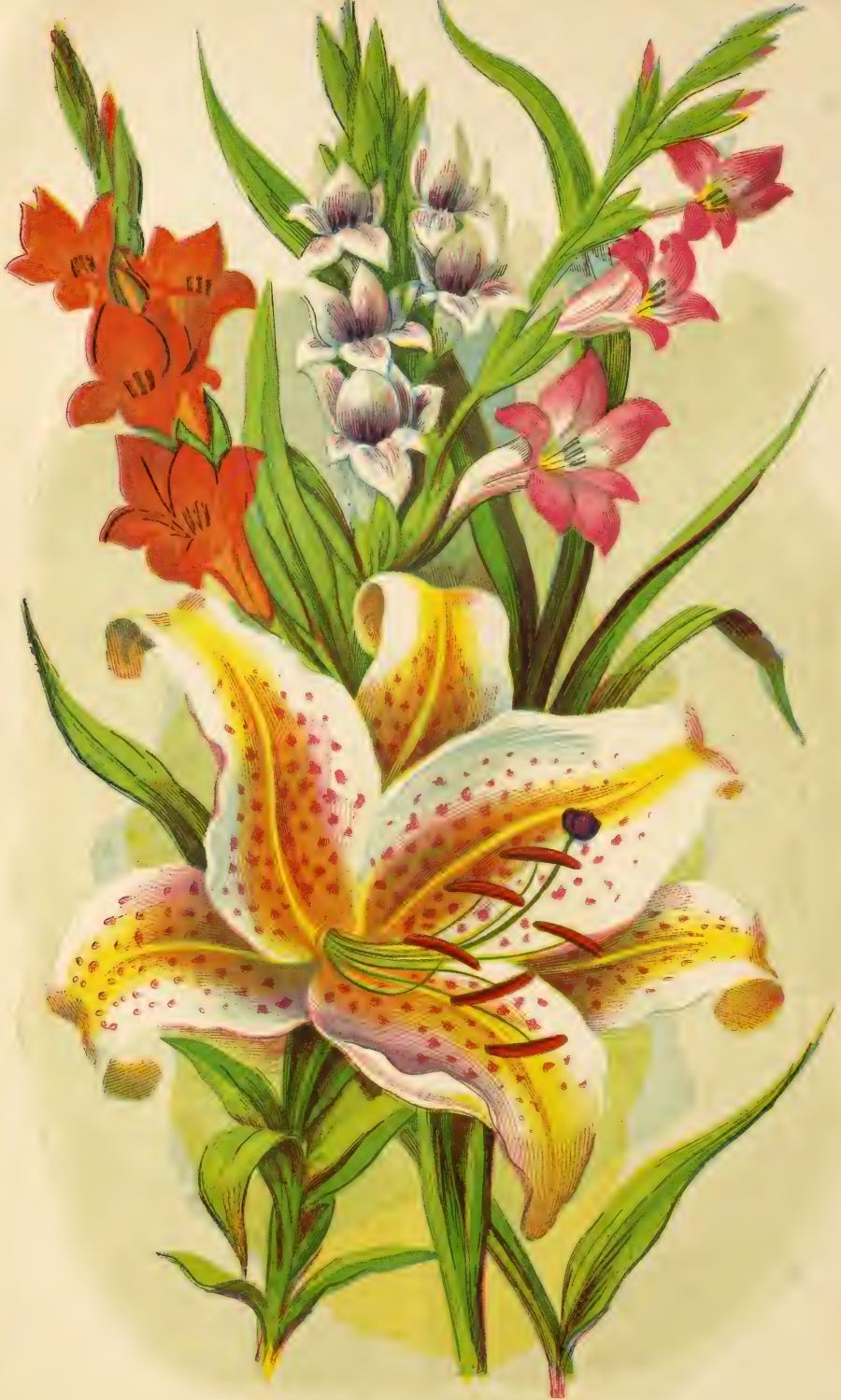
LILUM AURATUM, OR GOLDEN JAPAN LILY.